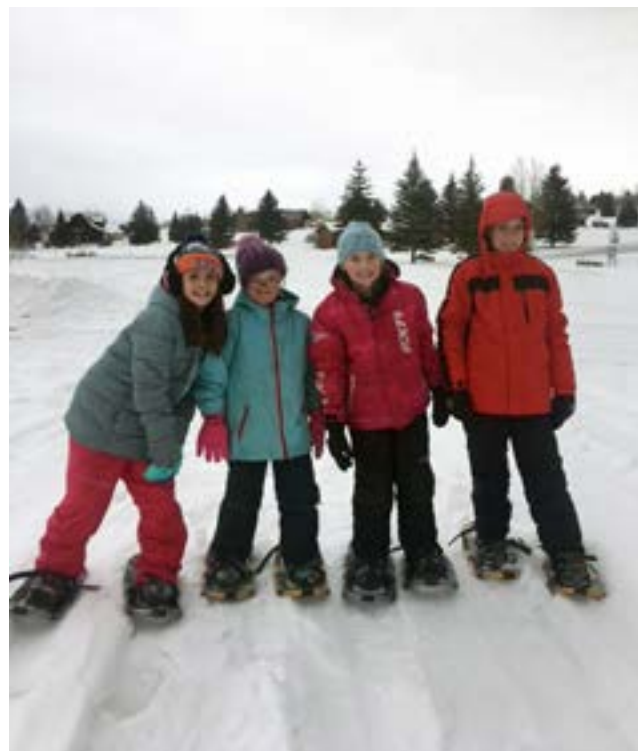
The cross-country skiing/snowshoeing enrichment class was great fun!